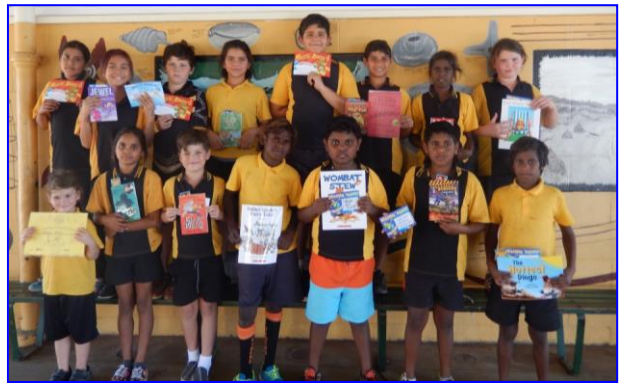
Student of the Week, Reading Awards, AFL Participation Awards and Anzac Day Competition Awards presented on parade on Monday 30 May, 2016.